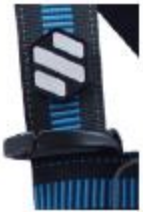
Break-away lanyard park loops