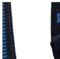
2.3kg tool loop