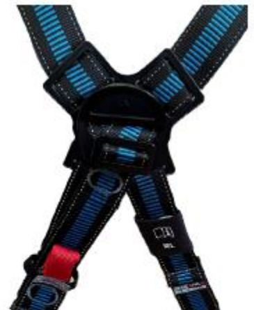
Removable rescue strop