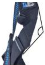
Patented hip fold