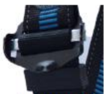
Alloy bar webbing adjuster