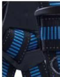
Soft UHMPE front attachment loop